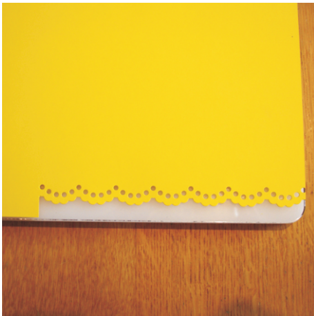
3 The first part of the decorative strip has been cut