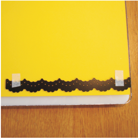
1 Adhere the die to the cardstock