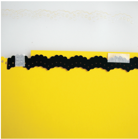
5 Adhere the die