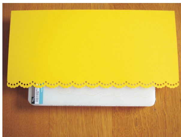
7 One long, decorative strip!