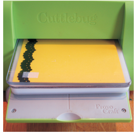
2 Die-cut the shape out of the cardstock